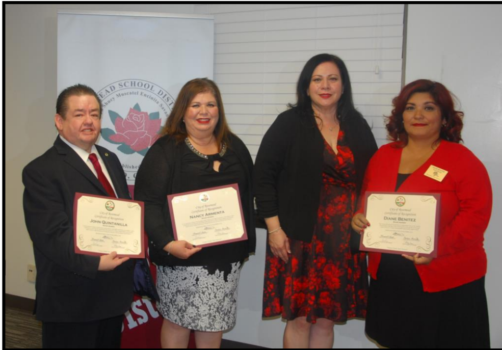
Presentation of Certificates City of Rosemead